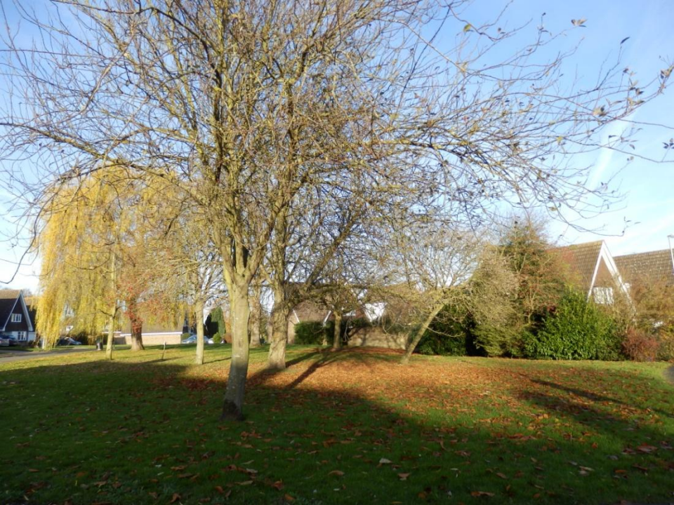
The dead trees on Moathouse Drive and St Giles Close greens are removed.